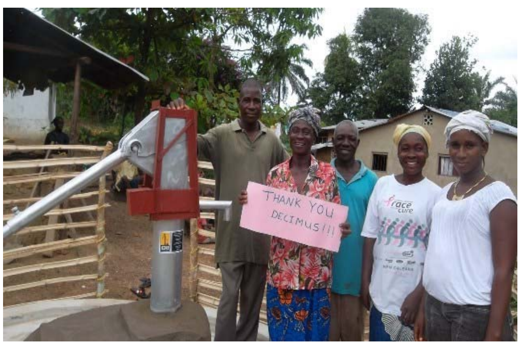
Water committee members who are responsible for helping maintain the well and who were provided with a Living Water Liberia contact number in case their well were to fall into disrepair, become subject to vandalism or theft.