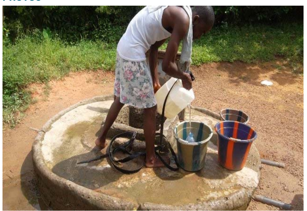
Previous water source depended on by the entire community to meet all of their water needs.