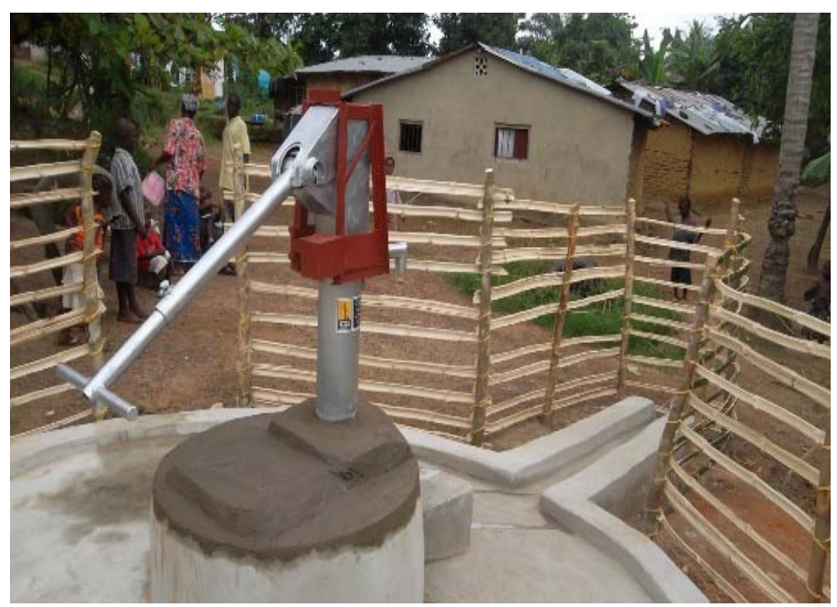
Completed\ water\ project.