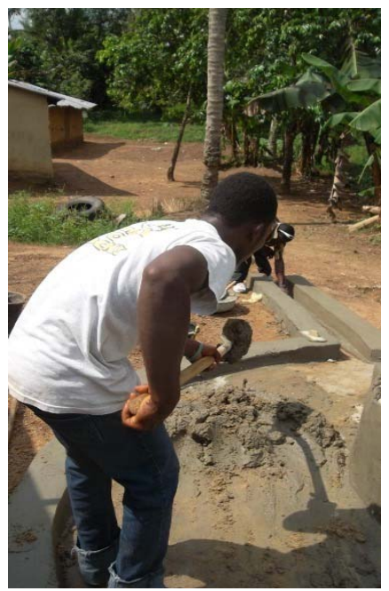
Project in process.